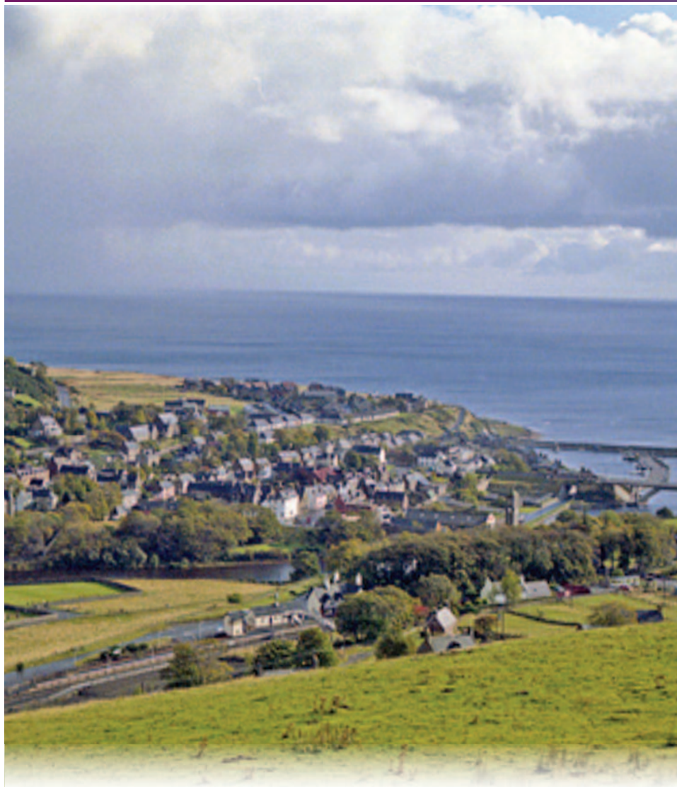
Helmsdale